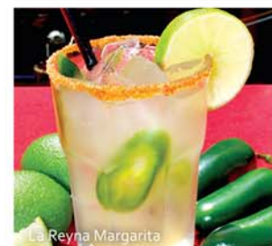
La Reyna Margarita

Segura Viudas Splits (175 ml.) $9 Veuve Clicquot $105 Dom Perignon $375