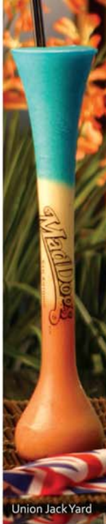
Union Jack Yard