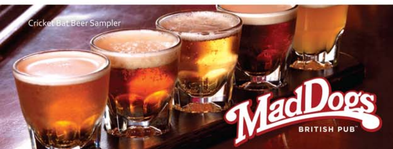
Cricket Bat Beer Sampler

C: Beer Cocktails: Your choice from our list.